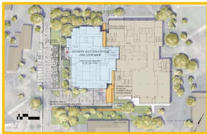
Figure 1 - GMU SUB I Site

are Grimm + Parker Architects and WTW Architects. Hess Construction + Engineering Services will be the Design-Builder. As for the building itself, the structural system used is structural steel. The brick veneer will consist of a color to balance the brick of the existing Student Union Building. To meet the requirements of DEB Notice 120108- Virginia Energy Conservation & Environmental Standards, Section 709.1, SUB I project