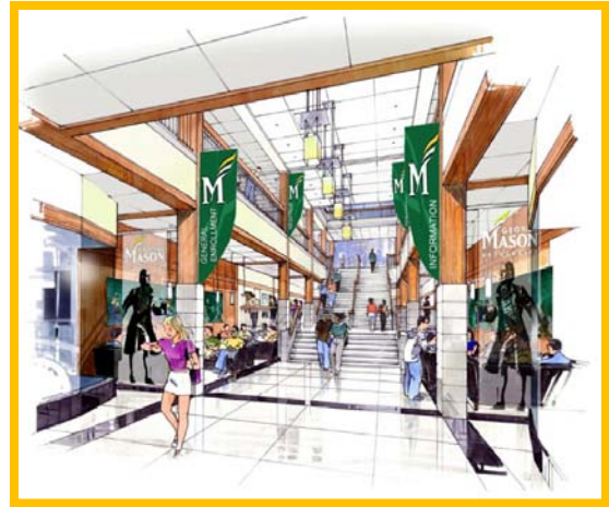
Figure 2 - Interior Rendering

George Mason University has had rapid growth at all of the campuses over the last couple of decades. George Mason's student population has increased to over 18,000 undergraduates. This growth has led to an increased demand for on-campus Student Union support and office space as George Mason University develops its educational operation. To satisfy this order of expansion, GMU has facilitated a 65,382 Gross Square Foot, four story addition to the existing Student Union Building I, located off of Aquia Creek Lane, soon to be renamed George Mason Boulevard. The addition will house meeting spaces, offices, and student service and activity spaces. With this in mind, George Mason University has decided to implement a design-build process to construct the addition to the existing Student Union Building I. This process will be in accordance with the Commonwealth of Virginia design-build procedures. The building will cost approximately $17.5 million. The project started in June of 2009 and is slated to finish in July of 2010 (estimated). The architects on the project